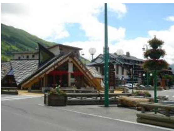
Tourist Information Office

From the Tourist Information Centre at the beginning of town continue straight down the main street, Avenue de la Muzelle. Past the climbing wall on your left, past the Marche U on your right down until you reach La Residence Building on your left and Hotel La Cret and Secrets Bar on your right. Here you will see a half round a bout with flags on it. Avenue de la Muzelle slims down into one lane here. Continue down.