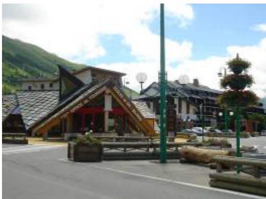
Above Left: Billboard Advertising New Apartments. Above Right: Les Chalets D'Or Entrance. Left : Tourist Information Centre