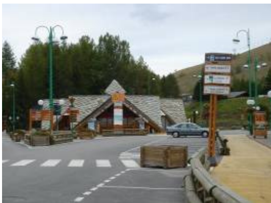
Tourist Information Office