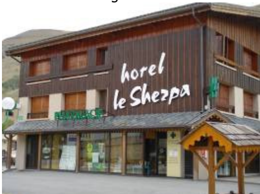
Opposite Le Diamant Building

From the Tourist Information Office, continue along Avenue de la Muzelle, drive past the climbing wall on your left, then shortly after the March U Supermarket on your right. 100m or so after, also on the right, at the end of the group of shops there is a street called Rue des Terres de Venosc (opposite the Spar Supermarket), turn right here. As a visual aid, the Bibliotheque is below the building.