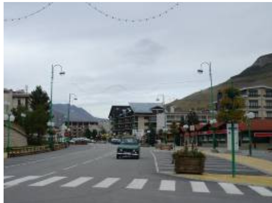
Spar Supermarket, Avenue de la Muzelle

From the Tourist Information Office, continue along Avenue de la Muzelle, drive past the climbing wall on your left, then shortly after the March U Supermarket on your right. 100m or so after, also on the right, at the end of the group of shops there is a street called Rue des Terres de Venosc (opposite the Spar Supermarket), turn right here. As a visual aid, the Bibliotheque is below the building.