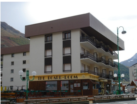
← Apartment Building La Residence

After entering Les Deux Alpes on the Avenue de la Muzelle (the only road into resort), the European Ski School is located on this same road on the left hand side, approximately 1km down, at the Place de la Croix de Limites (round-a-bout) just before the street narrows. The European Ski School is on the ground floor of the Apartment building La Residence where you will find the 'Board-room' Bar and 'Ski Extreme' Shop among others. It is also opposite the Secret Bar and the Cret Hotel which are both a few hundred meters down from La Cairn restaurant which has a big windmill out the front.