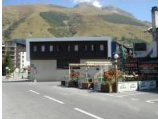
Turn right at La Table Restaurant