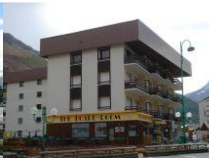
La Residence Building