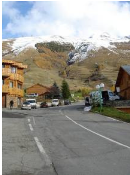
Rue des Banchets