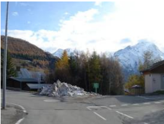
Take your first left at round-a-bout