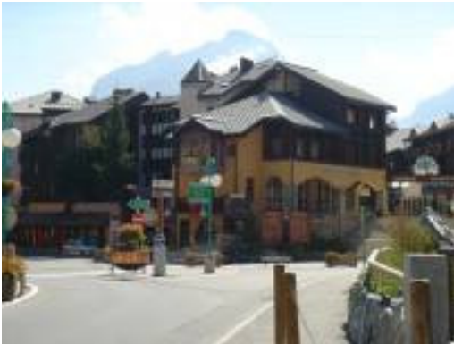
End of Av. De la Muzelle, T-Intersection

Janremon, 9 Rue des Banchets, Les Deux Alpes