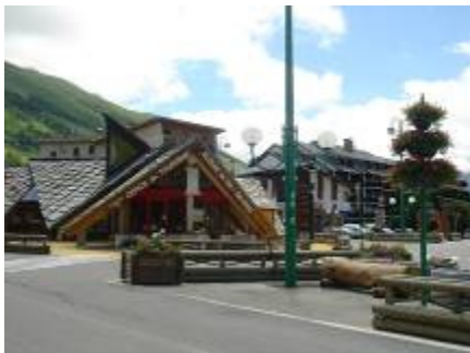
Tourist Information Centre

From the Tourist Information Centre at the beginning of town continue straight down the main street, Avenue de la Muzelle. Past the climbing wall on your left, past the Marche U on your right down until you reach La Residence Building on your left and Hotel La Cret and Secrets Bar on your right. Here you will see a half round a bout with flags on it. Avenue de la Muzelle slims down into one lane here. Continue down.