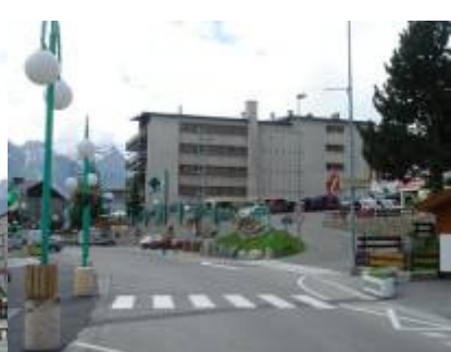
Avenue de la Muelle 1 Lane

Continue down until the road ends at a T-intersection. Turn Left here, followed by a right 100m on (Pizzia Restaurant La Table on one corner and the Diable Red Gondola on the other). Follow this road around the bend and straight until you come to a four way intersection with a round-a-bout painted on the road. Turn Left here. Follow the road right to the end, the Janremon is the last driveway/building on your left.