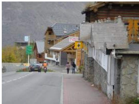
Main Road out of town