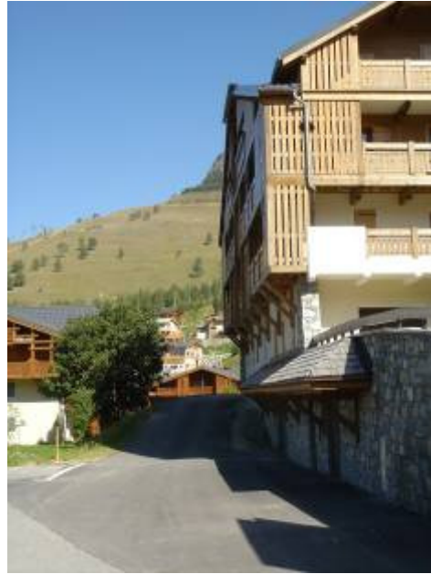
Driveway to left of building