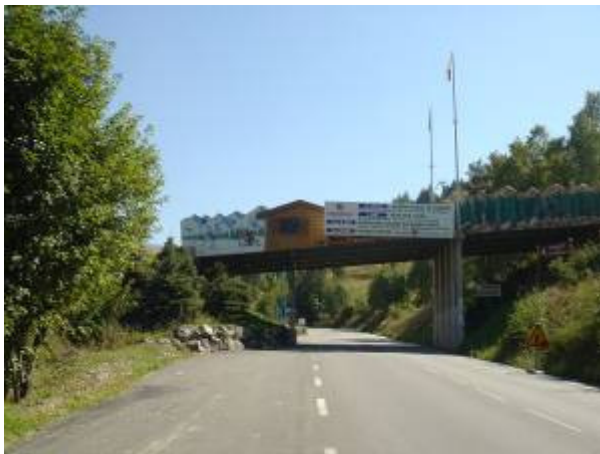
Bridge Over Main Road

After climbing up the bends to Les Deux Alpes the road will carry on under a small bridge with a large advertisement for Les 2 Alpes. Shortly after the first residential street on your left you will see a large billboard on your left advertising new apartments that are being built. Just behind this sign is Le Majestic. The building also next to the BP Service Station. There is a small amount of parking out the front. Alternatively, using the driveway to the left of the building, there is more parking behind. . If you reach the tourist information centre and the beginning of town you have gone too far!!