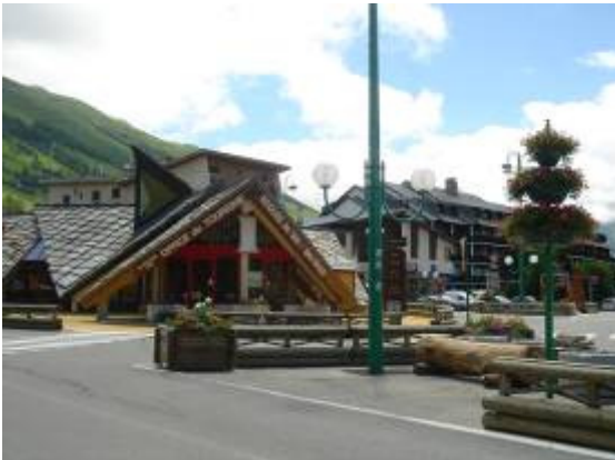
Tourist Information Centre

Turn around and go back down the main road the way you came in. Continue down 150m until you see the service station on the right, slow down here. Le Majestic is the building right after the BP service station.