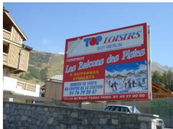
Sign Advertising New Apartments