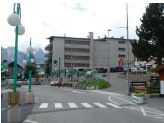
Right turn on to Rue du Rouchas