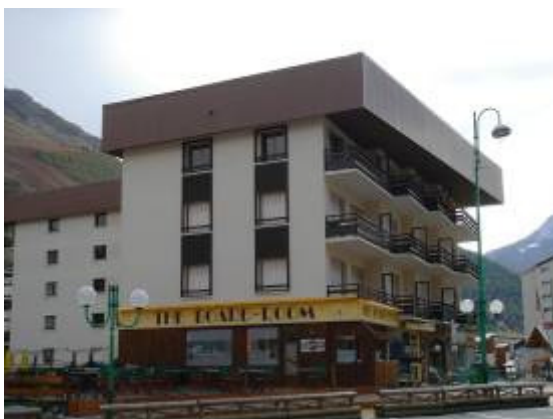
← Apartment Building La Residence

After entering Les Deux Alpes on the Avenue de la Muzelle (the only road into resort), the European Ski School is located on this same road on the left hand side, approximately 1km down, at the Place de la Croix de Limites (round-a-bout) just before the street narrows. The European Ski School is on the ground floor of the Apartment building La Residence where you will find the 'Board-room' Bar and 'Ski Extreme' Shop among others. It is also opposite the Secret Bar and the Cret Hotel which are both a few hundred meters down from La Cairn restaurant which has a big windmill out the front.