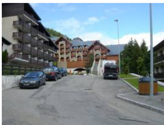
Veer Right to see Pluton Directly in front