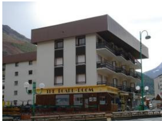
La Residence Building

Continue straight on the Avenue de la Muzelle for another 70m. Take the first street on the right, Rue du Rouchas. This road starts winding up the side of the hill. Turn down the first street on your right. The Pluton is directly in front of you.