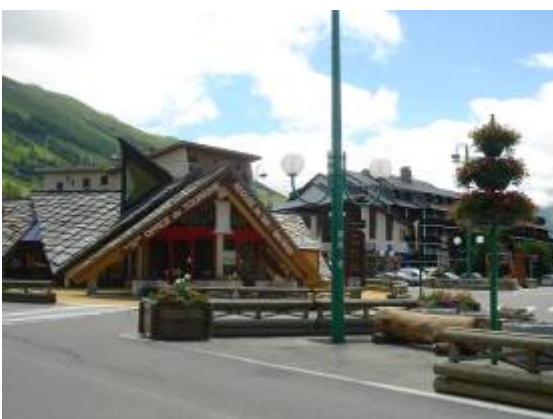
Tourist Information Centre

From the Tourist Information Centre at the beginning of town, continue along the Avenue de la Muzelle. Past the climbing wall on your left, then the Marche U Supermarket on your right (This is where the Avenue de la Muzelle becomes one way, still two lanes however. Continue along for another few hundred meters until you reach half a round-a-bout with flags on it, this is Place de la Croix des Limites, Avenue de la Muzelle narrows down into one lane after this point. On your left you will see the Residence Building with the European Ski School, Ski Extreme, a sweetsies shop and The Boardroom Bar underneath it. On the opposite side of the road is The Secret Bar and Hotel Le Cret.