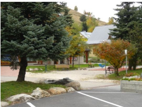
Playground Opposite Building