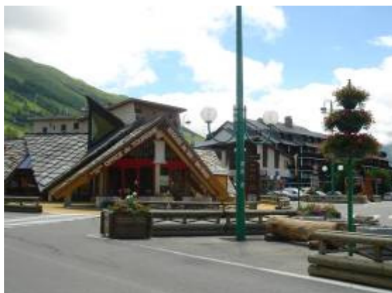
Tourist Information Centre

From the Tourist Information Centre at the beginning of town continue straight down the main street, Avenue de la Muzelle. Past the climbing wall on your left, past the Marche U on your right down until you reach La Residence Building on your left with the European Ski School underneath it along with the Board Room Bar. On your right is the Hotel La Cret and Secrets Bar.