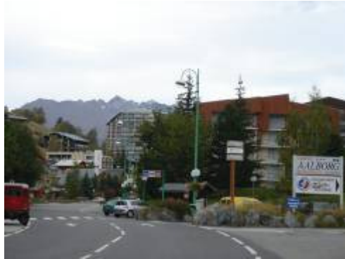
Rue Des Sagnes

Le Tyrol is approximately 250 meters down on your right. The building is directly opposite a children's playground.