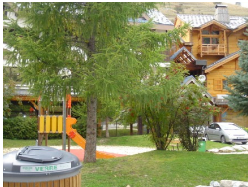
Playground Opposite Building