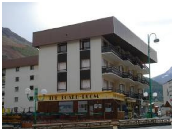
La Residence Building

Here you will see a half round-a-bout with flags on it (Place de la Croix des Limites), turn left here. 200m down is another round-a-bout, take the 2nd street on your right (Rue de L'Oisians).