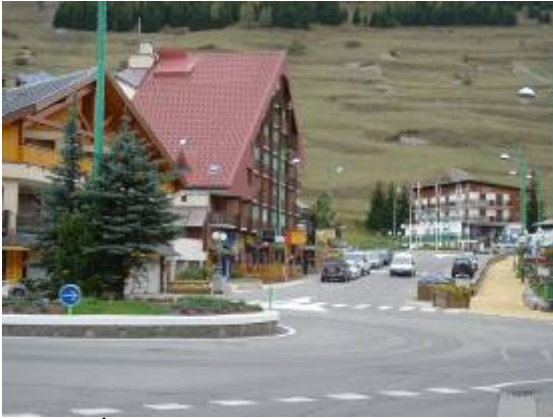
Take 2 nd Right at this round-a-bout

Les Violettes is the second building on your left (on the right hand side of the Neige et Mer Building)