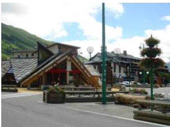
Tourist Information Centre

From the Tourist Information Centre at the beginning of town continue straight down the main street, Avenue de la Muzelle. Past the climbing wall on your left, past the Marche U on your right down until you reach La Residence Building on your left with the European Ski School underneath it along with the Board Room Bar. On your right is the Hotel La Cret and Secrets Bar.